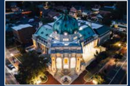
March: Evening Views of Handley Library