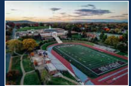
September: Handley Bowl