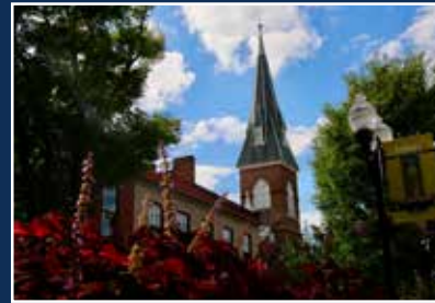
August: First Presbyterian Church Steeple