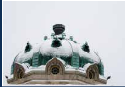
January: Handley Library in the Snow