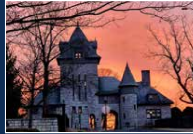
February: Mount Hebron's Winter Sunrise