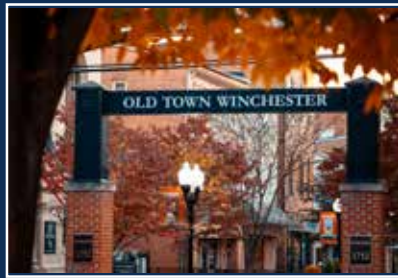
October: Autumn in Old Town