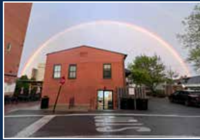
April: Indian Alley Under the Rainbow