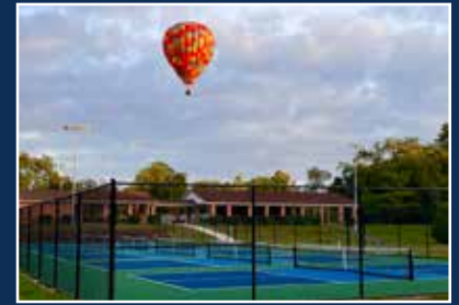
June: Hot Air Balloon Over Pickleball Courts