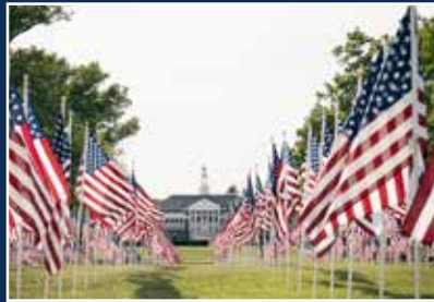
July: Memorial Flags at Handley High School