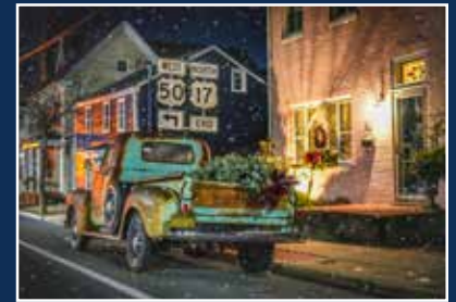
December: Holidays in Winchester

PRSRT STD US POSTAGE PAID WINCHESTER, VA PERMIT #25