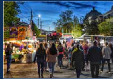
May: Apple Blossom Midway