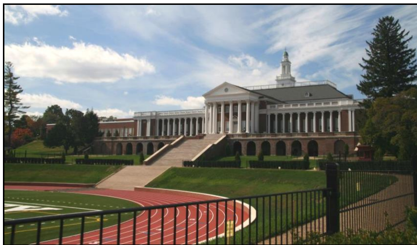
John Handley High School epitomizes Winchester residents' pride in education and community.