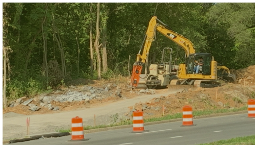
Green Circle Trail-Phase III Add trail where none existed and painted crosswalks.