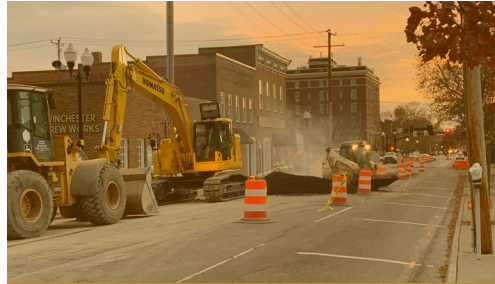
N. Cameron Drainage-Phase I Replace sewer/stormwater pipes to reduce flooding.