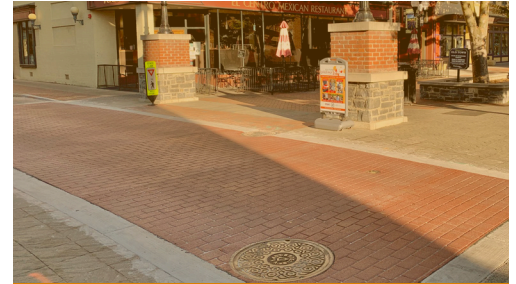
Boscawen Street at Loudoun Intersection Replace damaged road surface.