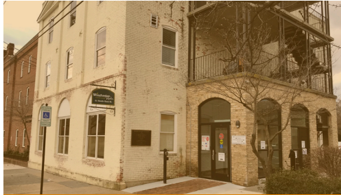
Creamery Building Renovate and relocate five offices to the building.