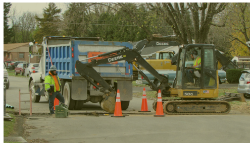
Wentworth Drive Replace water/sewer/stormwater pipes, sidewalks, repave road.