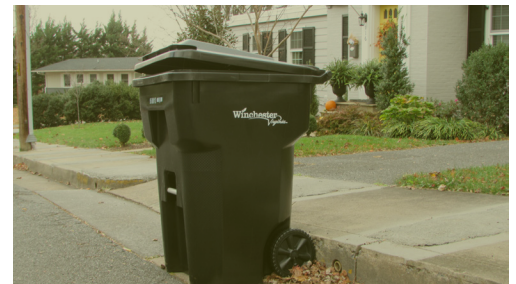
Trash Cart Pilot Program Use roll-off carts in four areas to test process and benefits.